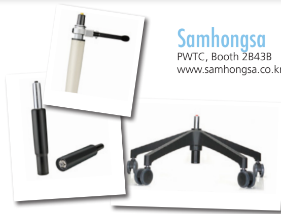
Samhongsu PWTC, Booth 2B43B www.samhongsu.co.kr