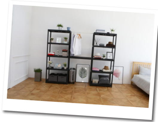
ANDCO PWTC, Booth 2B42B