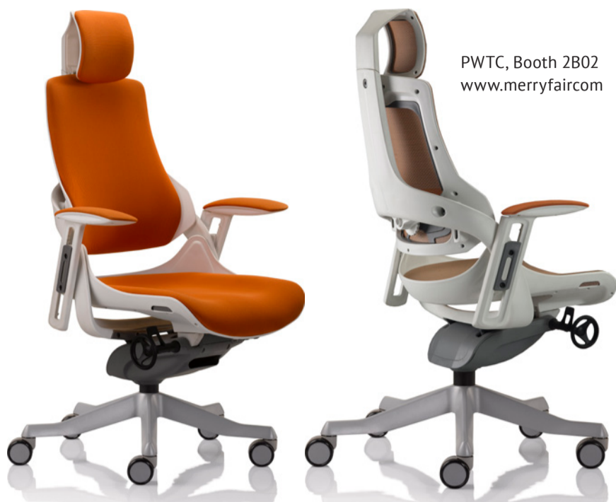
PWTC, Booth 2B02 www.merryfair.com

Merryfair Chair System has been participating in MIFF since 1995 and is looking forward to capture more buyers for their new products through MIFF OFFICE this year.