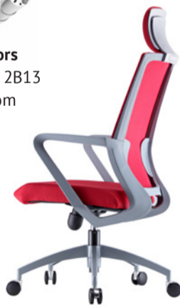
Classic Chair System PWTC, Booth 2B19 www.classchair.com.my