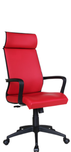
Boston Office Furniture PWTC, Booth 2B51 www.boston.com.my