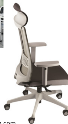
Nexus Office System PWTC, Booth 2A03 www.nexuscollection.com