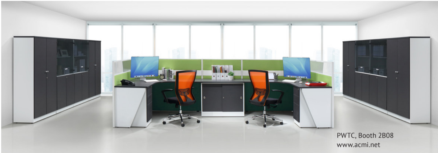
PWTC, Booth 2B08 www.acmi.net