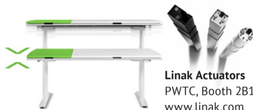
Linak Actuators PWTC, Booth 2B13 www.linak.com