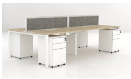
Safari Office System PWTC, Booth 2B05 www.safariofficesystem.com