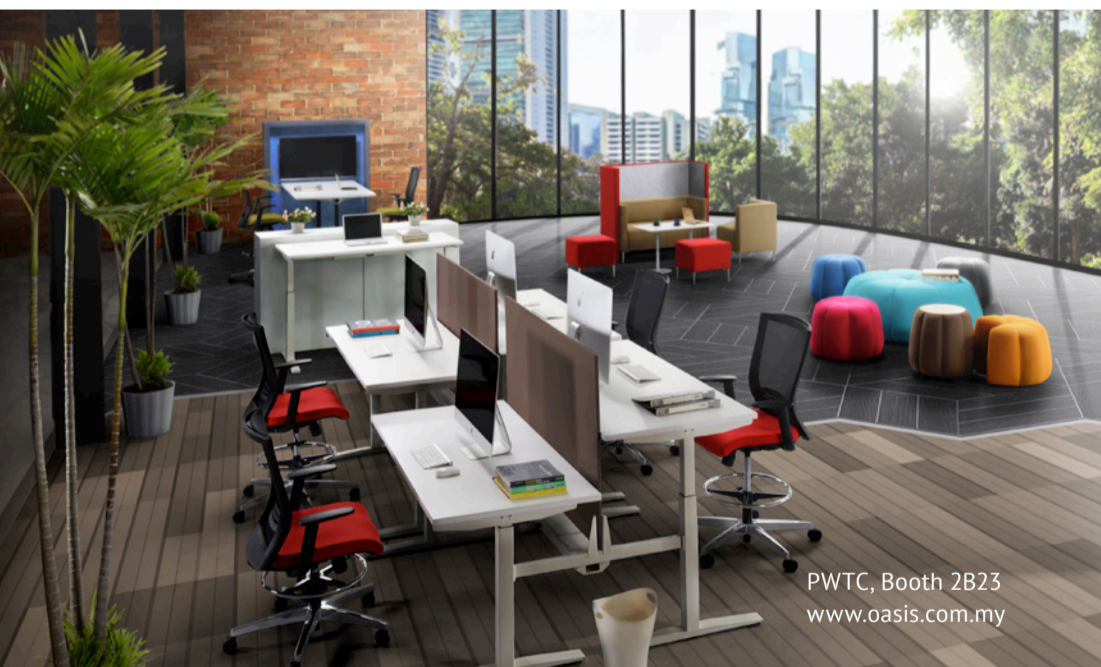
PWTC, Booth 2B23 www.oasis.com.my