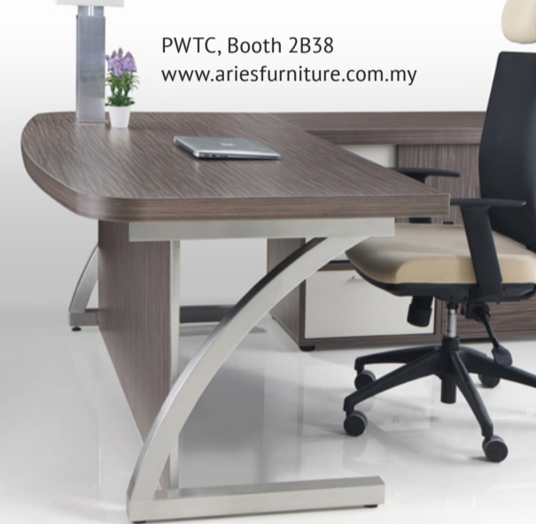
PWTC, Booth 2B38 www.ariesfurniture.com.my

The floating elegance exuded by Aries Furniture's office furniture range can easily furnish a number of spaces within a single facility while maintaining a distinct aesthetic. Dedicated to support a broad range of functional elements, the designs of this range make reference to classic architectural features in a distinctively modern manner.