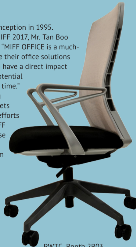
PWTC, Booth 2B03 www.eurochairs.com