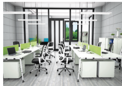
Apex Office Furniture Exporter PWTC, Booth 2B21 www.apexof.com.my