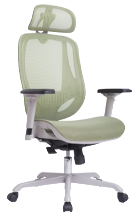
Zhejiang Henglin Chair Industry PWTC, Booth 2A02 www.henglin.com