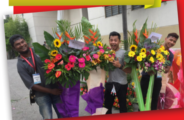
World Petals employees do their best Bollywood actor impression, popping out dramatically from behind flowers they are delivering to Wasaniaga Sdn Bhd (PWTC, Booth 102) and other exhibitors.

Globally Recognised The Preferred Manufacturer In Asia