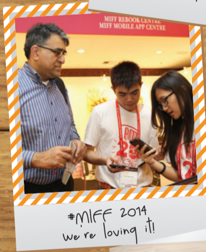
#MIFF 2014 we're loving it!