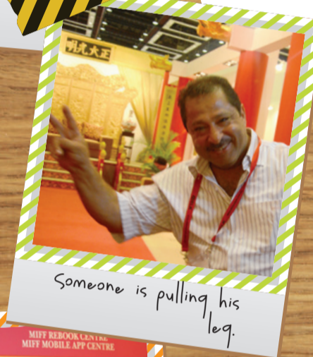
Someone is pulling his leg.