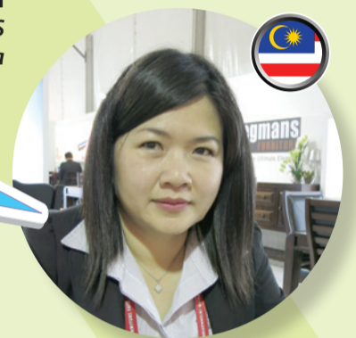
WYNCE KOH WEGMANS FURNITURE INDUSTRIES Malaysia

We have been so busy since day 2. There has been a non-stop stream of customers, with a good turnout from Russia. The retro- and modern-themed sets are selling like hot cakes.