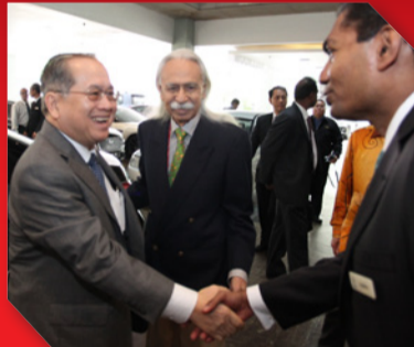
(Left) Datuk Seri Douglas Uggah Embas, Minister, Ministry of Plantation Industries & Commodities