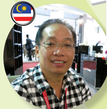
S.T. YIP HOTTRAX FURNITURE Malaysia

We have been coming to MIFF for 20 years and it's more like a family to us now. So far, we have bought some exquisite designs in rubberwood, dining and extension tables. We always enjoy the Buyer's Night. We feel that it is a very good venue for buyers like us.