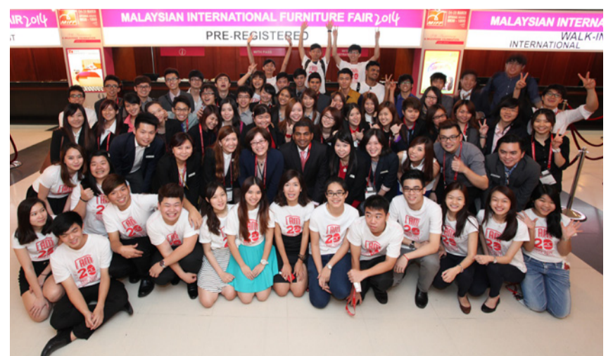
Team MIFF 2014 wish to express its gratitude and appreciation to all exhibitors, visitors and buyers for joining on this incredible journey to MIFF 20th anniversary. MIFF awaits you all in 2015 and beyond.