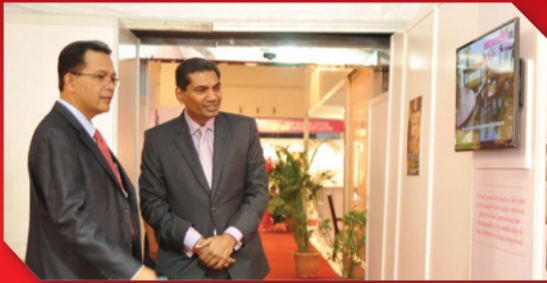
(Left) Dato' Ir Hj Hamim Samuri, Minister, Ministry of International Trade and Industry