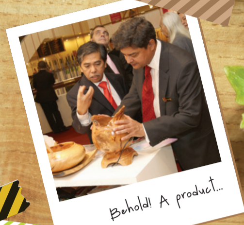
Behold! A product...