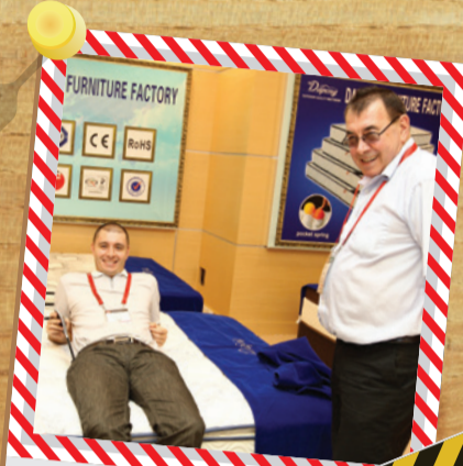
A hard day's work...