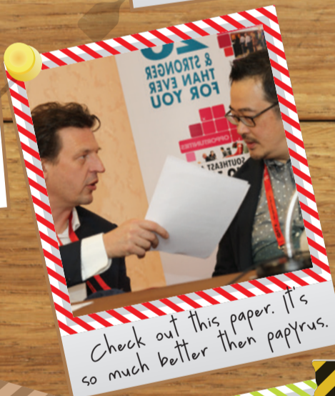
Check out this paper. It's so much better than papyrus.