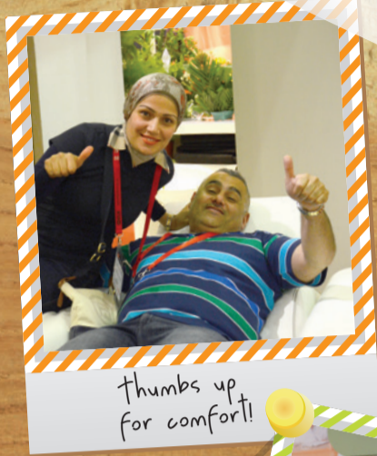
Thumbs up for comfort!