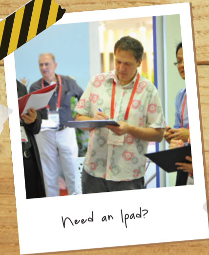
Need an Ipad?