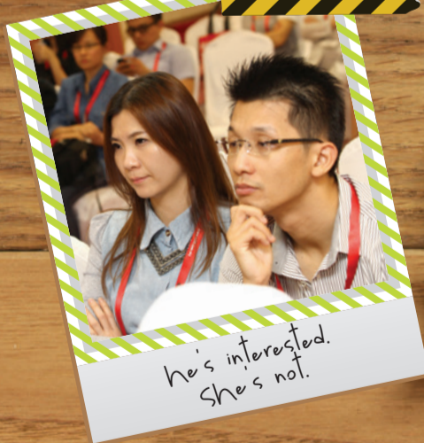
He's interested. She's not.