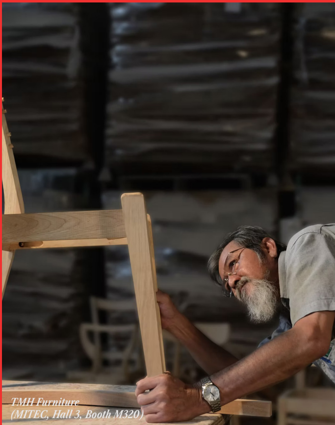
TMH Furniture (MITEC, Hall 3, Booth M320)

"Wood is authentic, warm, and full of life. Its unique grain, texture, and natural aroma give each piece a distinctive character while offering our design team endless creative possibilities."