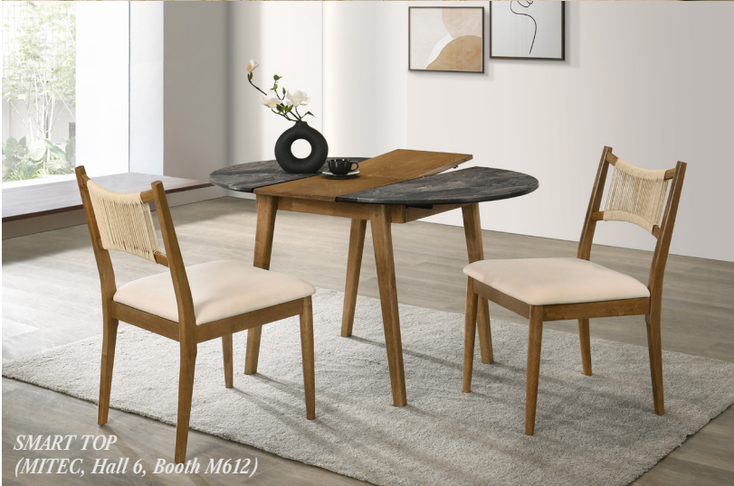
SMART TOP (MITEC, Hall 6, Booth M612)

“Beyond innovation, what people ultimately buy is a feeling: the belief that they’re choosing something genuinely well-made.”