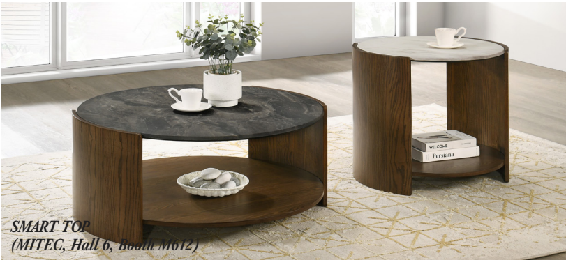
SMART TOP (MITEC, Hall 6, Booth M612)