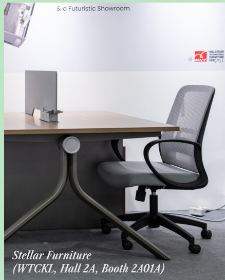
Stellar Furniture (WTCKL, Hall 2A, Booth 2A01A)

Stellar's recent investments reflect that mindset. The company has poured resources into new molds, R&D, and compliance standards to meet emerging expectations across markets—including sustainability certifications, AI-assisted product development, and international ergonomic benchmarks.