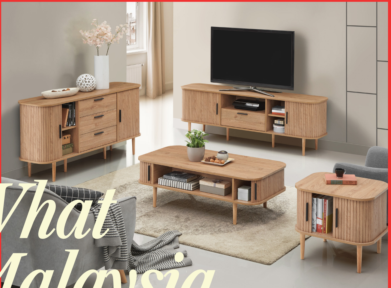
Living Room set by Ecomate