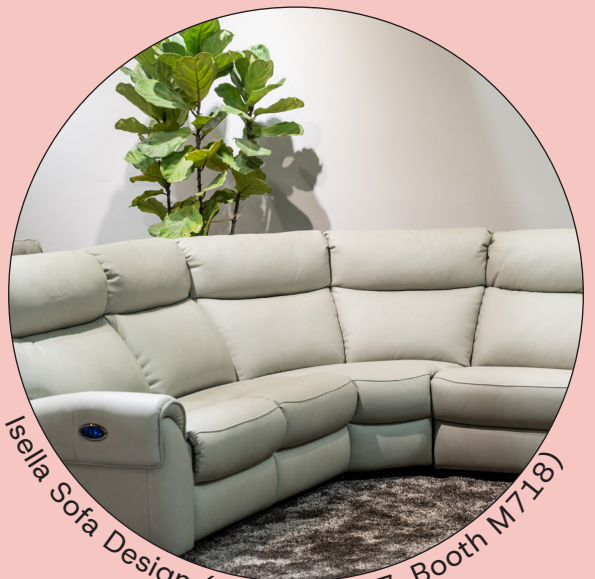
Isella Sofa Design (MITEC, Hall 7, Booth M718)