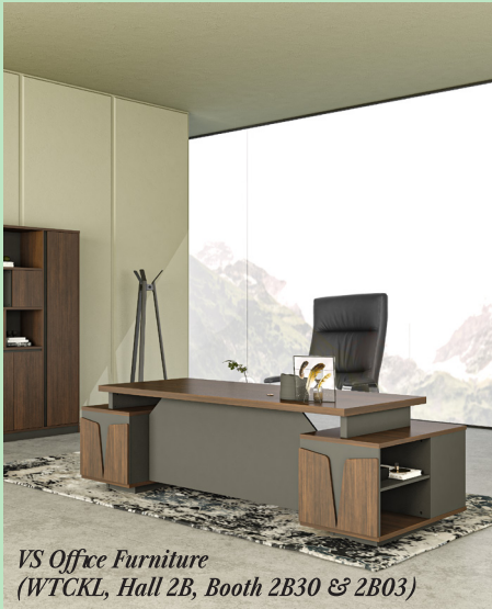
VS Office Furniture (WTCKL, Hall 2B, Booth 2B30 & 2B03)

The company's roadmap reflects these shifts. "In the next few years, we are focusing on modular workstations, ergonomic chairs, and collaborative furniture," Gan adds. "We are also growing our home-office line and investing in sustainable and smart designs."