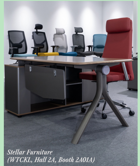
Stellar Furniture (WTCKL, Hall 2A, Booth 2A01A)

Home-office demand is here to stay, not just as a pandemic workaround, but as a permanent category—something everyone is starting to realise.