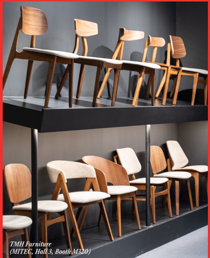
TMH Furniture (MITEC, Hall 3, Booth M320)