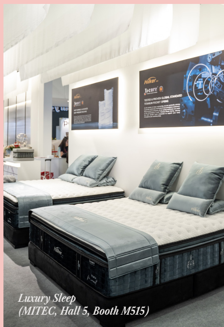
Luxury Sleep (MITEC, Hall 5, Booth M515)

While these results aren't anything to scoff at, Luxury Sleep concedes that people may not yet fully grasp the value of smart living products: “Many consumers struggle to understand the long-term benefits of smart-tech furniture, especially when the price appears higher at first glance... When consumers recognise how technology enhances precision, comfort, and personalisation, the value becomes much clearer.”