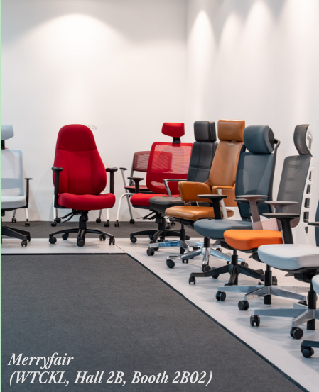
Merryfair (WTCKL, Hall 2B, Booth 2B02)

Today's professionals expect far more than a desk and a chair that "gets the job done." They want ergonomics, adaptability, and interiors that feel intentional rather than improvised. A broken armrest or a fixed cubicle setup tells you everything. The space wasn't designed with people in mind.