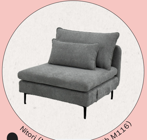
Nitori (MITEC, Hall 1, Booth M116)