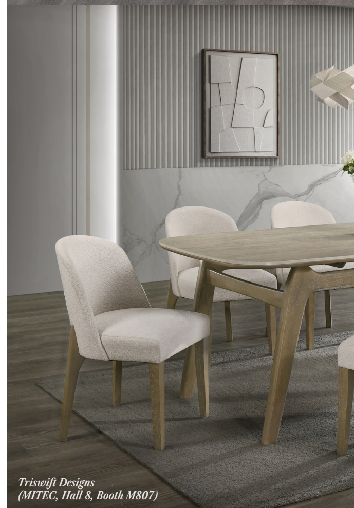
Triswift Designs (MITEC, Hall 8, Booth M807)