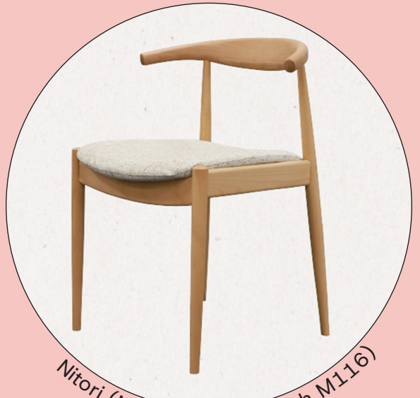
Nitori (MITEC, Hall 1, Booth M116)

a smarter, more convenient integrate technology— ture is at the heart of that