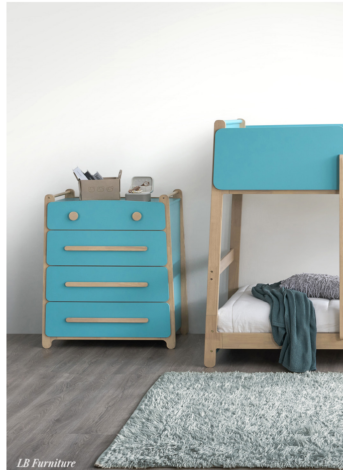
LB Furniture (MITEC, Hall 7, Booth M702)

Triswift Designs is preparing for a market shaped by online retail and more flexible lifestyles. Jia Hao shared, "Over the next three years, occasional furniture is expected to grow the fastest due to its versatility, adaptability, and strong performance in online sales channels." He also mentioned the growing interest in mixing wood with "metal, fabric, or leather accents" to create pieces suitable for modern interiors.