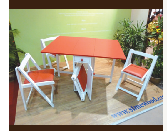
Table in the box

Simewood's foldable butterfly table is a true epitome of modern living which is both inspiring and space-saving. Both the chairs and tables can be folded, while the chairs can be slotted and kept in the compartment under the table. In the end, all that is left is merely a slim, rectangular case that can be easily stored anywhere in the house or brought anywhere as a mobile set.