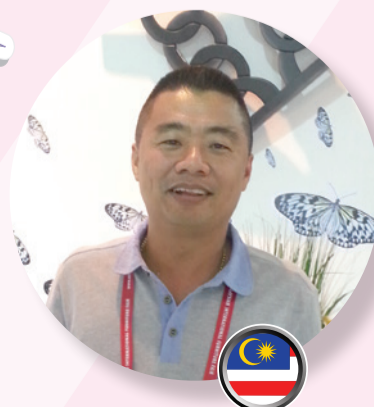
JS CHUA Home JS Furniture Malaysia

We focus on dining sets and console tables. The dining set with the rustic look is one of our popular items, attracting customers from Europe and U.S.A. This year, we launched the 'butterfly' theme as can be seen in the way we shaped the back of the dining chairs. For MIFF 2015, we hope to have just one venue for all exhibitors.