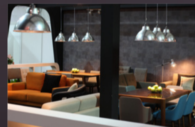
TRENT UPHOLSTERY INDUSTRIES Booth E19, MECC Hall E