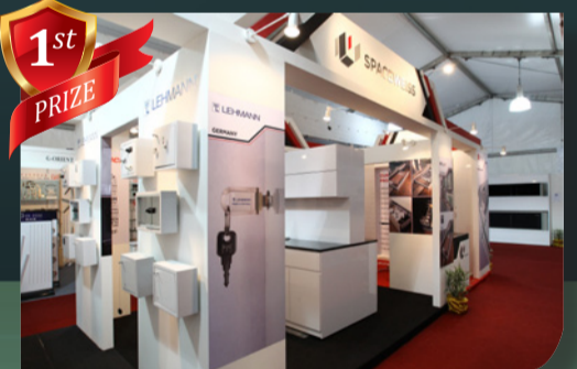
SPACEWEISS SOLUTIONS Booth 4D35, PWTC Hall 4D