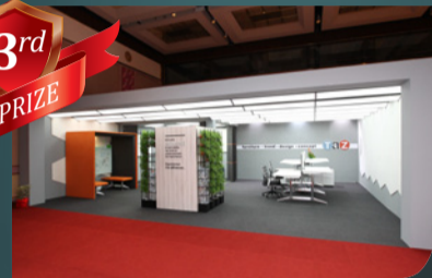
TAZ CORPORATION Booth 2B37, PWTC Hall 2B