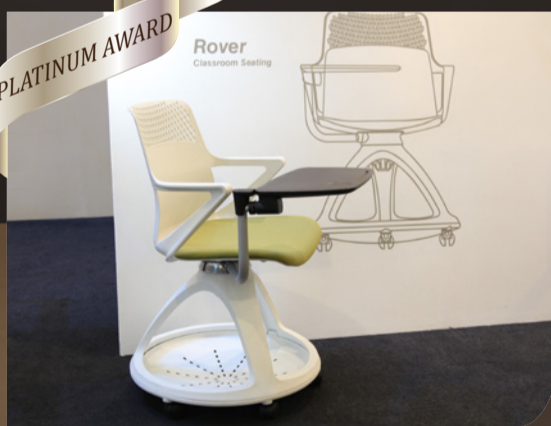
MERRYFAIR CHAIR SYSTEM Booth 2B02, PWTC Hall 2B ROVER