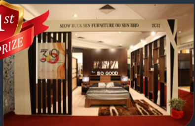
SEOW BUCK SEN FURNITURE Booth 2C12 & 2C12A, PWTC Hall 2C

“The inspiration of our booth comes from our furniture. We wanted a concept that will make our customers feel that our home is also their home.”