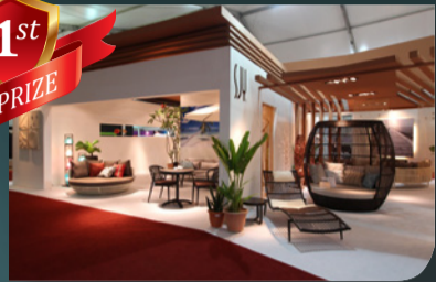
SJY FURNITURE Booth D03 & D04, MECC Hall D

“Every year, we try to come up with different themes. This year, we wanted a showroom concept wherein there are different sections for outdoor and indoor furniture.”