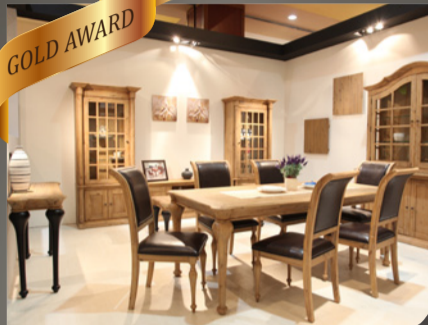
ACACIA HOME FURNISHING Booth 146, PWTC Hall 1 AHF 1404 (HOME CONCEPT)