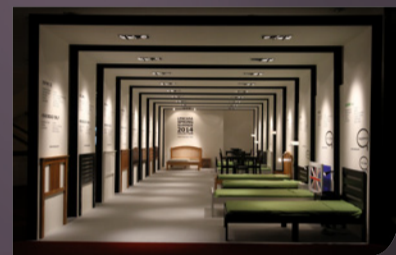
LENCASA Booth 4A01, PWTC Hall 4A