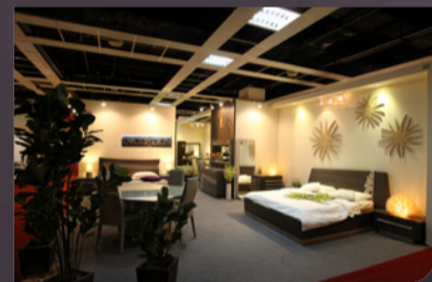
INCEPTION DESIGN & TRADING Booth 322, PWTC Hall 3