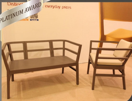
RESOL GROUP Booth 2B41, PWTC Hall 2B CLICK-CLACK