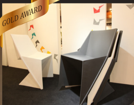
MERRYFAIR CHAIR SYSTEM Booth 2B02, PWTC Hall 2B JUVEL