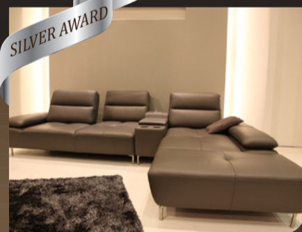
OMEGA SOFA Booth 113, PWTC Hall 1 GLADIOLUS

“I think the design and functionality of the Rover Chair stood out for the judges. It's made of plastic materials particularly polypropylene. It is very functional in a sense that it's a chair with a table and storage of sort for your bags.”