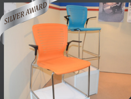
TAY HUAH FURNITURE CORP Booth 4C03, PWTC Hall 4C OM5 ACTIVE (SLED CHAIR)