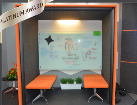
TAZ CORPORATION Booth 2B37, PWTC Hall 2B COLPOD (COLLABORATION POD)