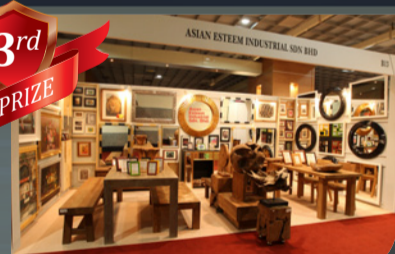
ASIAN ESTEEM INDUSTRIAL Booth B13, MECC Hall B