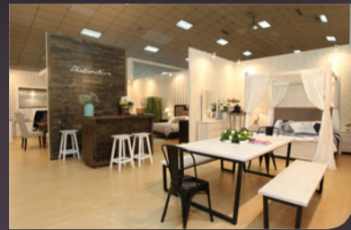
DISTINCTIVE FINE FURNITURE Booth 217, PWTC Hall 2