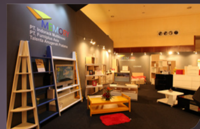
PT INDORACK MULTIKREASI Booth 143, PWTC Hall 1