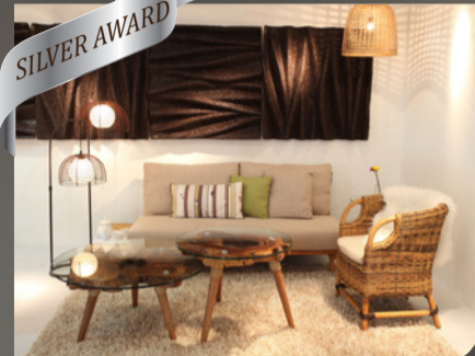
SJY FURNITURE Booth D03 & D04, MECC Hall D 740-3 (PULMAGE SOFA SET)