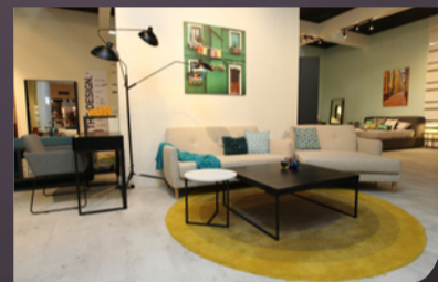
HIN LIM FURNITURE MANUFACTURER Booth 216, PWTC Hall 2