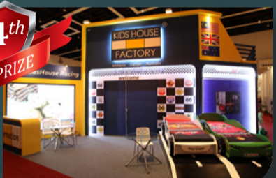
KIDS HOUSE FACTORY Booth 123, PWTC Hall 1