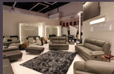
OMEGA SOFA Booth 113, PWTC Hall 1