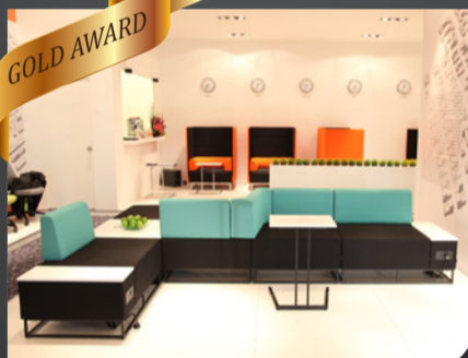
BENITHEM Booth 2B36, PWTC Hall 2B MODE